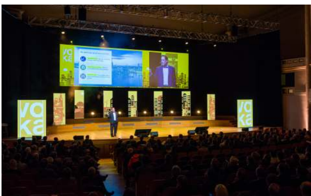
The Voka congress annually unites more than 1.000 entrepreneurs during a unique experience. The congress is one of the largest national activities for entrepreneurs in Flanders.

Various network activities in Flanders bring entrepreneurs closer to each other.