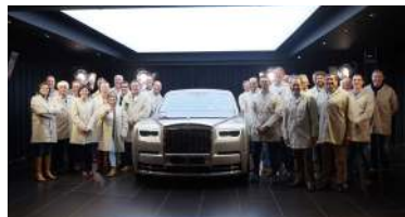
A delegation of Voka members during a visit of Rolls Royce headquarters at Goodwood, United Kingdom.

Voka organises trade missions, inspiration tours and participates in official delegations, together with our entrepreneurs and in close cooperation with the official services.