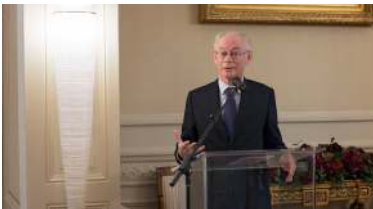
Former President of the European Council Herman Van Rompuy delivers a keynote speech at the "Legends and Leaders" Voka event series.

Voka brings the world to Flanders. Top congresses and exclusive meetings are organised to put our region on the map.