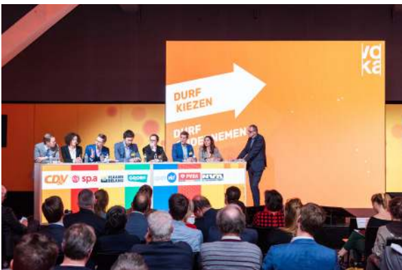
Because of the national and European elections, Voka organised several election debates with politicians and entrepreneurs in order to discuss Voka propositions.

We organise a permanent dialogue between the various authorities, governments and politicians. One of the core tasks of Voka consists of bringing politicians and entrepreneurs closer to each other.