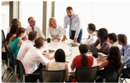
Every year more than 700 companies participate in the Voka business clubs.

Our proactive peer-to-peer learning programmes are a true success. They unite entrepreneurs and experts to exchange knowledge and good practices on doing business abroad.