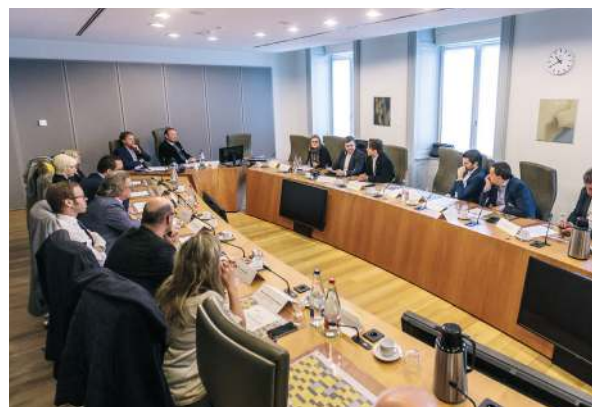
Voka is an officially recognised social partner in the social consultations in Flanders.

As the largest and most representative employers' organization in Flanders, Voka is a neutral and reliable partner to the government. Therefore Voka is recognised as a social partner in the official deliberative bodies.