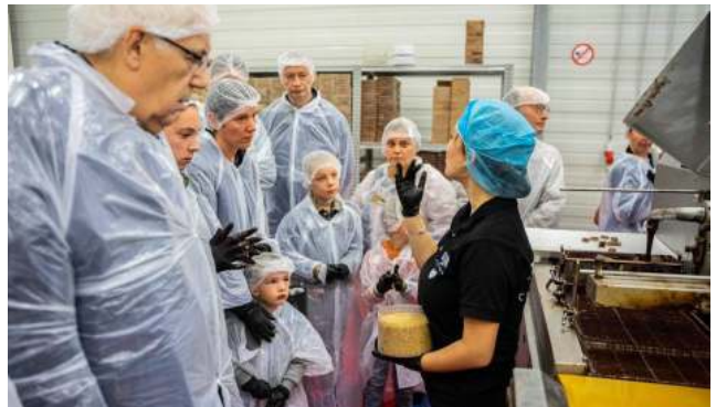
Voka Open Bedrijvendag: every year more than 600.000 interested people visit the Voka enterprises.

Once a year, Flemish companies open their doors to the public. During the Voka Open Bedrijvendag more than 350 companies are open for an exclusive view behind the scenes.